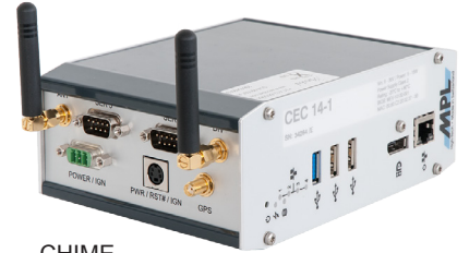
CHIME mPCIe expansion