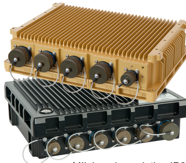
MIL housing solution IP67