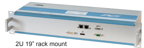
2U 19" rack mount