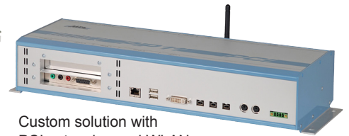
Custom solution with PCI extension and WLAN