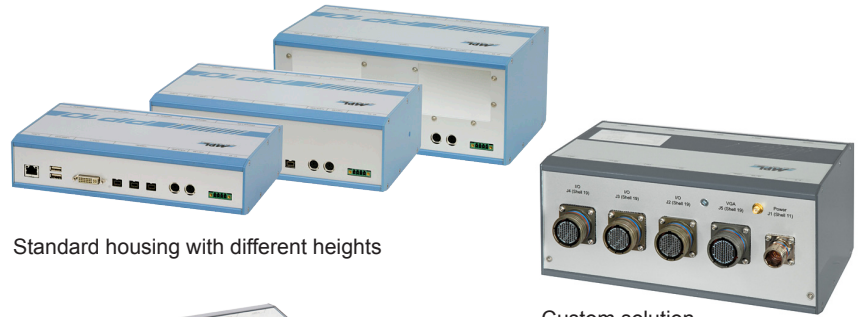
Standard housing with different heights

In case of special needs any RAL color can be used for your OEM case. The MIL Outdoor housing comes in Jet Black (RAL 9005) but other RAL colors are possible as well.